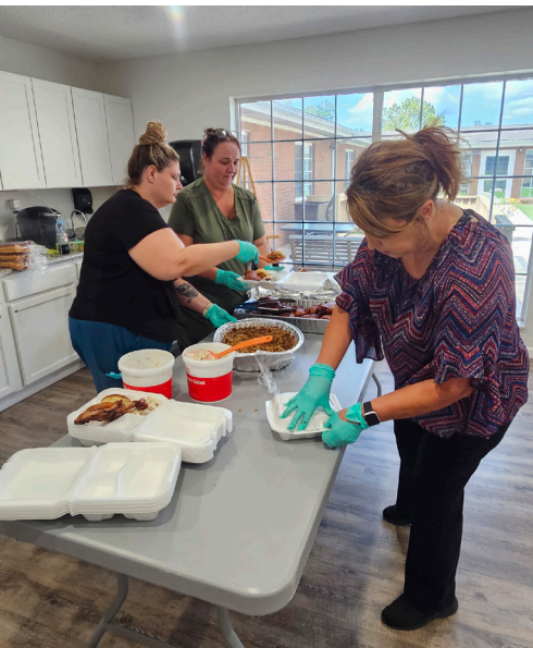
Preparing for Cookout!