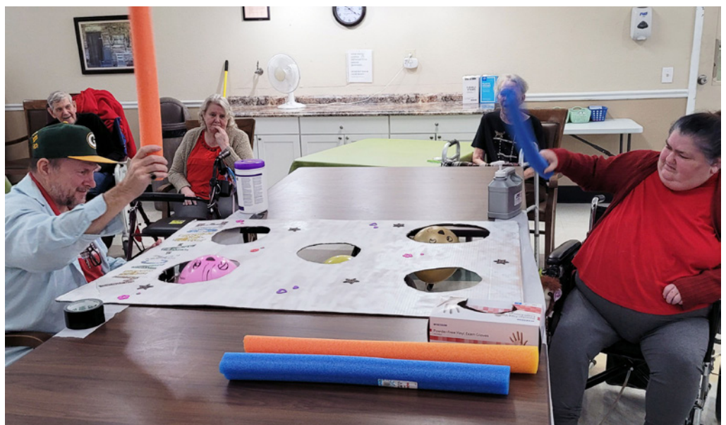
Residents enjoying our new games. Whack the Mole and Hole in One. We had lots of giggles and laughs.