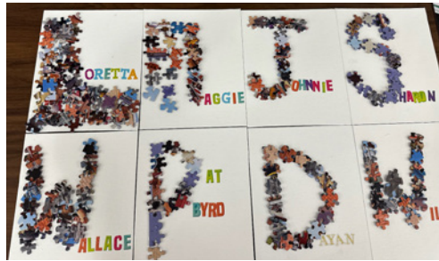
For arts and crafts we used puzzle pieces to make their initials. They turned out really good.