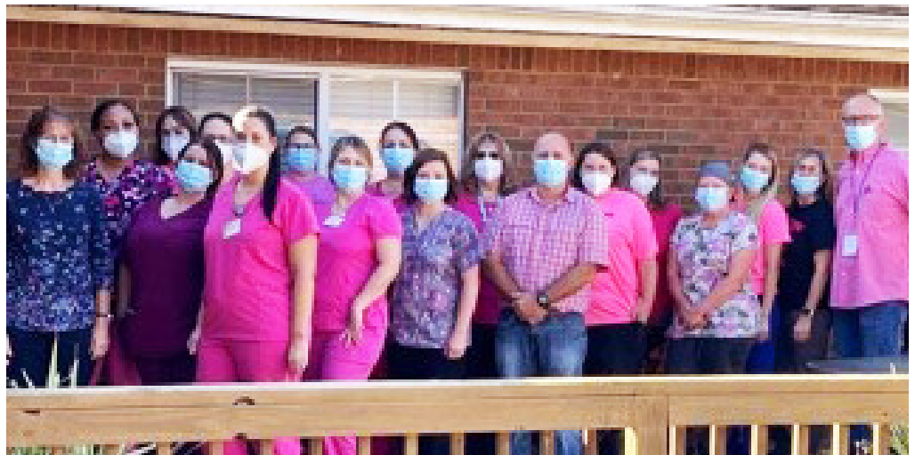
Staff dressed in pink to celebrate Breast Cancer Awareness Month. Look at all that Pink!!