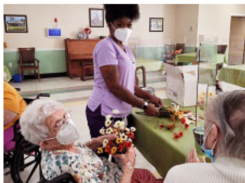
They turned out so cute. They put them in their rooms.