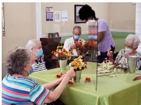
Residents enjoyed making their fall flower arrangements.