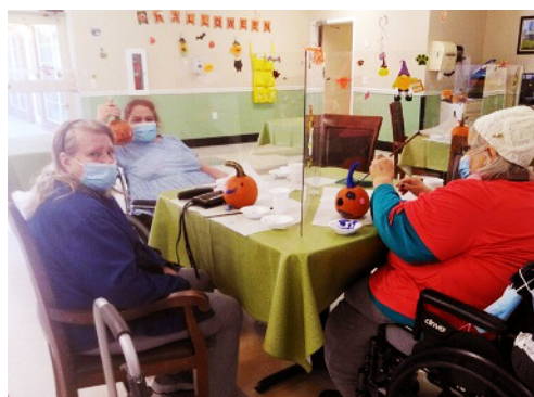
Residents enjoy painting their pumpkins.