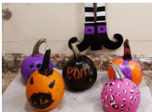
Look at all those great pumpkins!