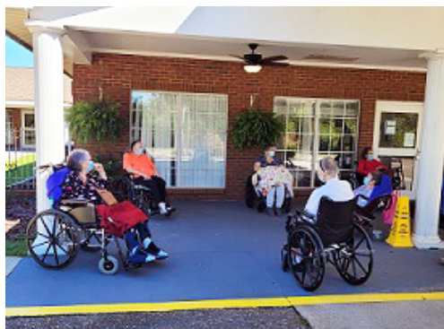
Residents enjoying the gorgeous weather. Fall is in the air!!

October was a busy month with Halloween, Pumpkin Carving and costume contests. Resident enjoyed all the Halloween festivities. Pictures of our winners will be announced in December's newsletter. Since the weather has been nicer, we have been doing more outside. Resident's enjoyed music and brain games on the patio. We also did some flower arranging so residents could put them in their rooms.